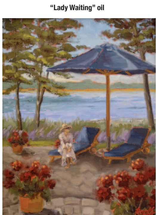
"Lady Waiting" oil

These two plein aire groups each meet one day a week in “open air” at a pre-determined site during the warm weather months to create their renderings of our beautiful northern Michigan scenes and views. Gatherings are open to everyone. You need only to show up at a pre-determined site. There is no cost, all medium (oil, pastel, watercolor, acrylic, pen and ink, etc) are welcome. All paintings will be completed and framed to meet deadline and be in the show. Visitors to the North will enjoy seeing “Plein Aire Artists at work when they sight see along our beaches, woods and countryside. Selection for hanging will take place on July 17th. Please remember that all paintings need be registered and turned in by deadline. For information on joining in, contact Emelie Braun at 231-675-0131. We have selected a few of the paintings