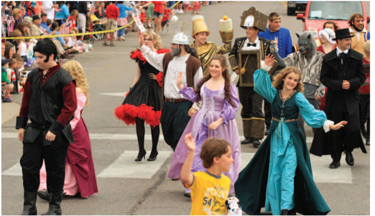
Members of Concord Academy Boyne's cast of Beauty and the Beast perform for the crowd during the Boyne City 4th of July parade