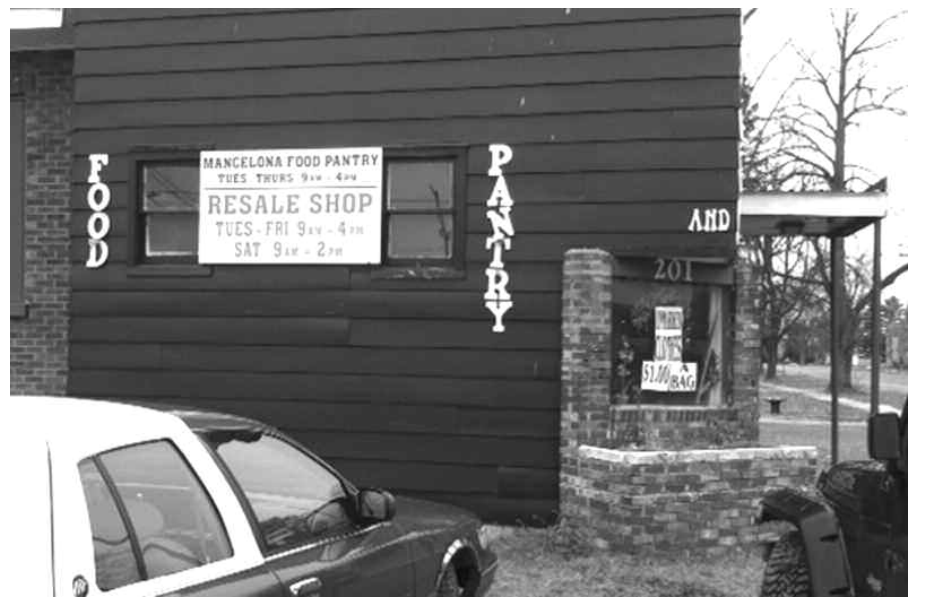
The Mancelona Food Pantry & Resale Shop is both an excellent spot to find quality, used items of virtually any kind, and the proceeds from sales at the Resale Shop help to support the ongoing mission of the Mancelona Food Pantry in providing food for area families in need.

The facility is a large three-story building that was once a church. Inside, customers will find two levels