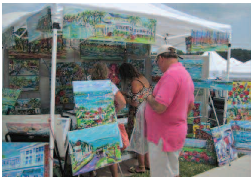
The 45th Annual Charlevoix Craft Show will take place in downtown Charlevoix's East Park on Saturday and Sunday, July 13th and 14th.