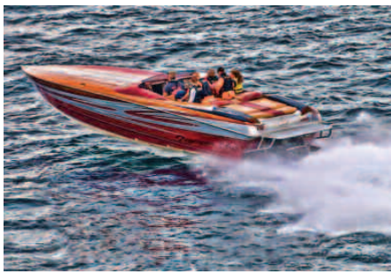
Speed, excitement and fun returns to Northern Michigan for the 10th annual Boyne Thunder Poker Run on July 12 and 13 in Boyne City.

starts at 9:30 a.m. Saturday from the Boyne City Marina, is the highlight of the weekend but the event offers so much more. From the moment the boats arrive to the time they depart Sunday there are activities galore in Boyne City. Events begin Friday with a dinner for the boaters at the Veterans Park Pavilion.