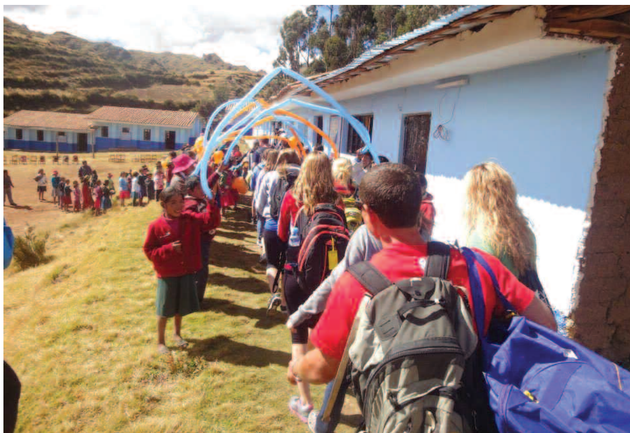
East Jordan students walking into the school with supplies. At each of the three schools they visited, the students in Peru would greet the travelers from East Jordan gleefully, singing songs, dancing and playing games.