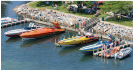
The event is expected to attract between 80 and 85 high performance boats. Since it began, Boyne Thunder has raised more than $220,000 for Camp Quality, and it has become an important part of the camp's success.

That same evening, downtown Boyne City comes alive for an expanded Stroll the Streets Friday evening. Incredible displays of Boyne Thunder boats and classic cars, stereo contest, combined with music on every street corner will make for a glorious evening in beautiful downtown Boyne City until 10:00 p.m.