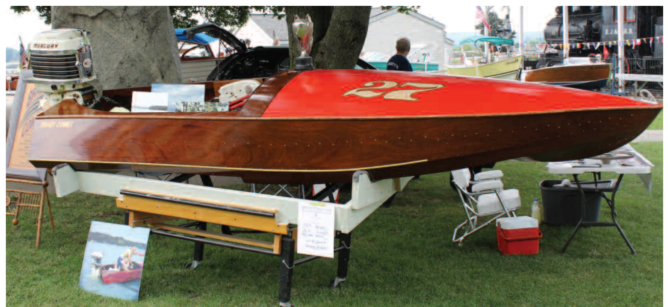
South Arm Classic provides attendees with a free opportunity to view classic examples of gorgeous vintage craft on the grounds at Memorial Park and in the waters of Lake Charlevoix.

For additional information visit www.southarmclassicboats.com