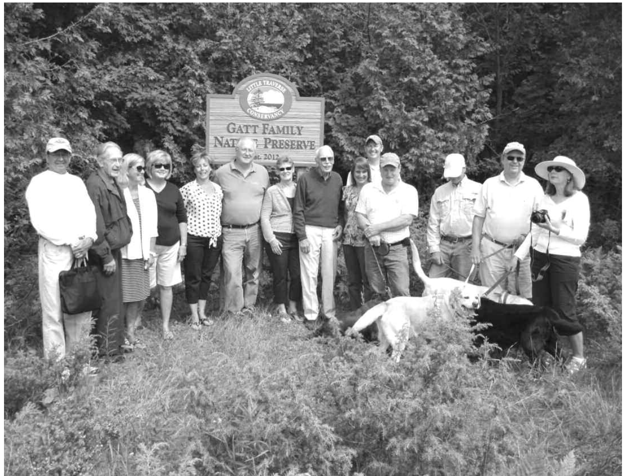
On July 2nd, a dedication ceremony took place for the new Gatt Family Preserve; a new 22-acre tract of land near Lake Charlevoix was recently acquired by the Little Traverse Conservancy.

Since 1972, the Little Traverse Conservancy has been working as the oldest regional, non-profit land trust in Michigan. With the support of more than 4,100 members, the Little Traverse Conservancy works with private landowners and units of local government to permanently protect ecologically significant and scenic lands from development. Since it was founded, more than 49,500 acres and 125 miles of shoreline along our region's lakes, rivers, and streams have been set aside to remain in their natural state within Charlevoix, Cheboygan, Emmet, Mackinac, and Chippewa counties. In addition, more than 4,000 young people participate in a Conservancy environmental education outing every year. For more information about the Little Traverse Conservancy and land protection options for your land, please contact their office at 231.347.0991 or visit www.landtrust.org .