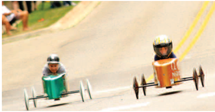
The annual soapbox derby participants enjoy a ride down park street.